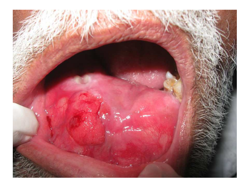
Figure 1: Intra Oral Photograpgh of Swelling with Labial, Buccal And Lingual Cortical Expansions