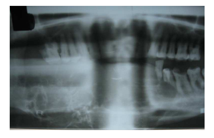
Figure 2: Opg Showing Honey Comb Lesion

CT scan showed an enlarged tumor extending from the ramus region of the lower right third molar region till the lower left second premolar region. The tumor caused severe expansion of the buccal and lingual cortical plates with multilocular appearance.