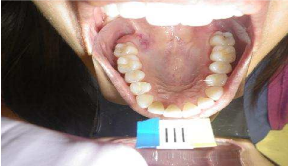
Fig # 1: Clinical Presentation: Discolored, Painful Area