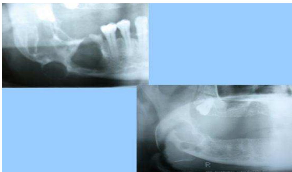
Fig # 5: a-b Section of Panoramic Radiographies: 8a-Initial Presentation. 8b-Recurrence

follicular cyst. Panoramic radiography was taken and a radiolucent multilocular, well circumscribed lesion, with cortical compromise and severe expansion, was seen. (Fig #5) New biopsy disclosed low grade CMC. Patient underwent block resection with 1.0cm margins and reconstructive bone plate placement. He is free of recurrence four years later.