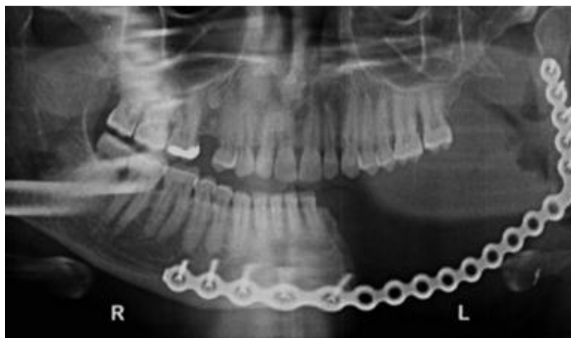
Fig # 4: Panoramic Radiography. Reconstructive Plate in Place

compromise and associated with an impacted molar. Biopsy showed central mucoepidermoid carcinoma intermediate grade. Partial hemi-mandibulectomy with 1.5 cm margin, and placement of a reconstructive bone plate was performed. (Fig # 4) No recurrence is found after one year.